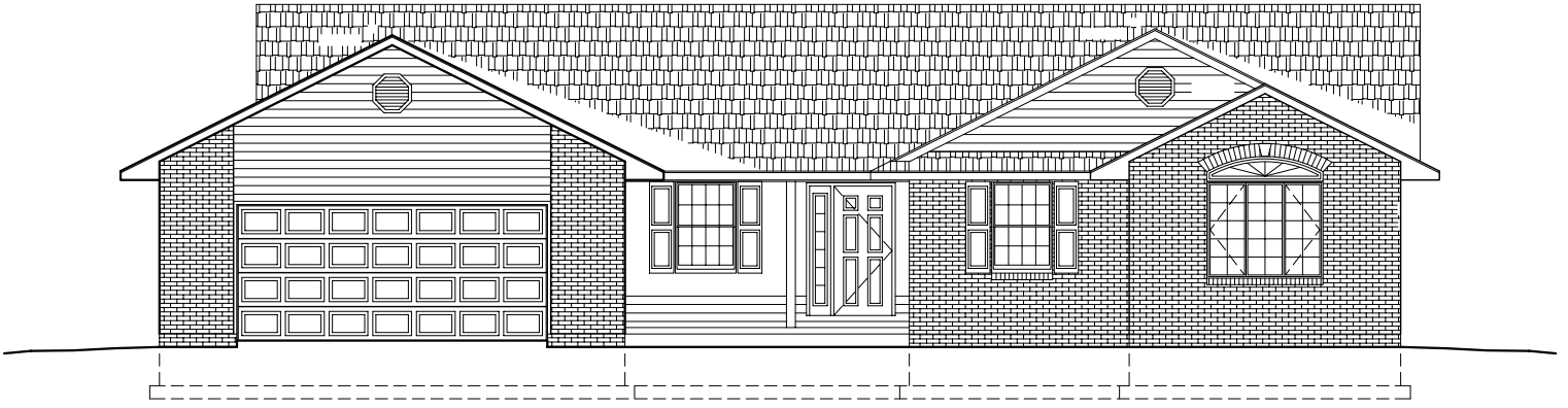
1 FRONT ELEVATION A-1